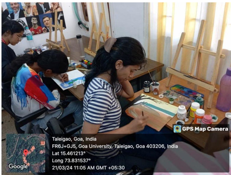
Participants immersed in the activity "Poetry Visualization through art."