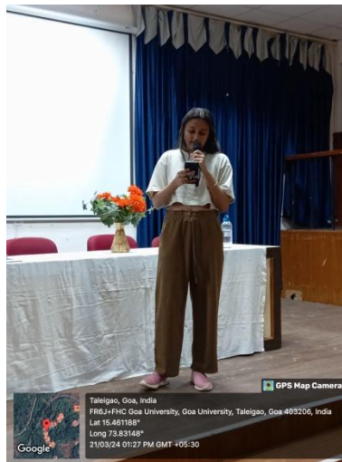
Students participating in the rap workshop