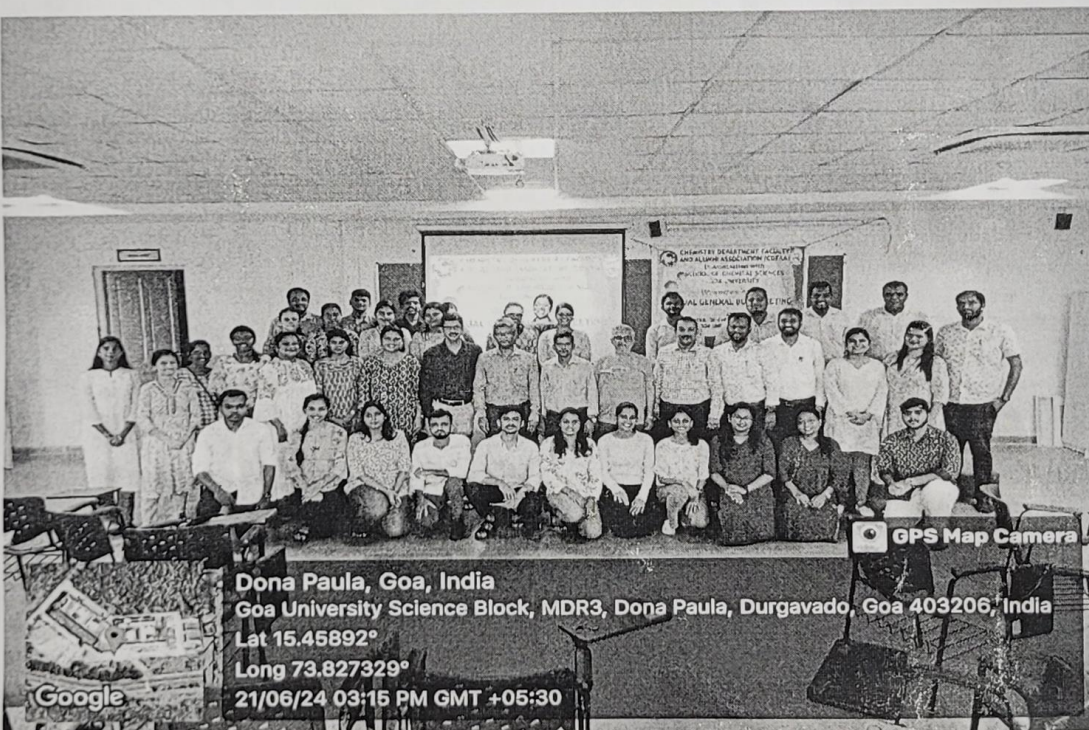
Dona Paula, Goa, India Goa University Science Block, MDR3, Dona Paula, Durgavado, Goa 403206, India Lat 15.45892° Long 73.827329° 21/06/24 03:15 PM GMT +05:30