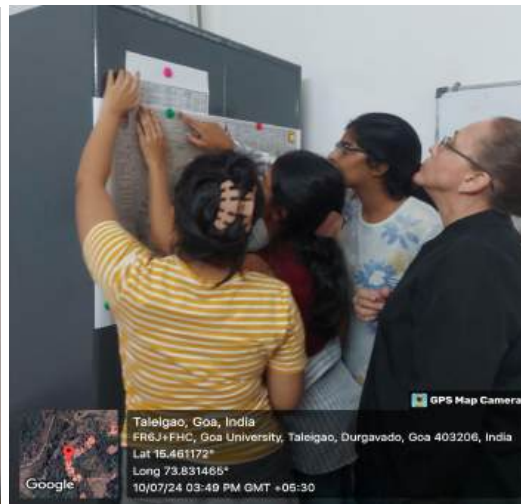
Photos 3 & 4: Be prudent! Seek, explore and unravel mysteries to claim your reward