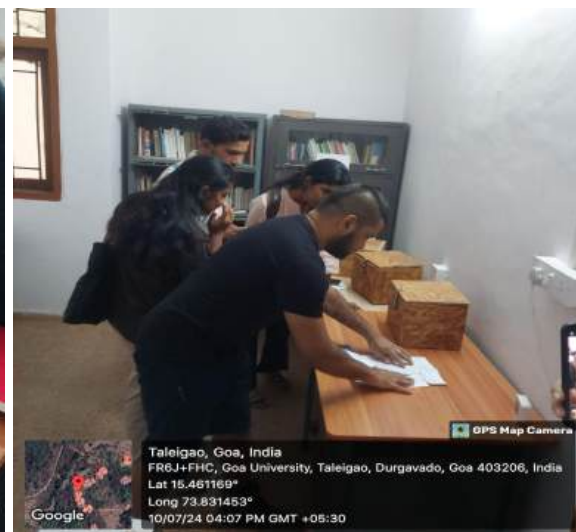
Photos 5 & 6. Dive into the thrill of hunting and experience the ultimate treasure hunt experience.