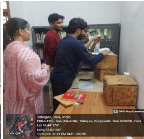
Photos 1 & 2: The participants challenged their wits to find the hidden treasure.