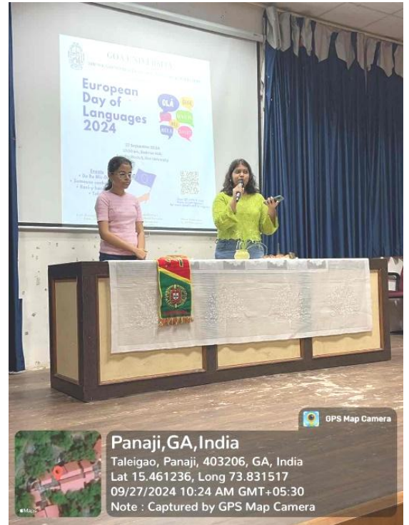
Presentation of food items at the event 'Somebody cooked here', by the students