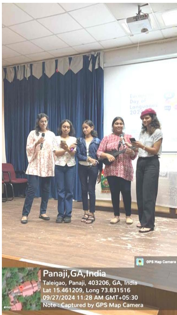
Group singing by students of Discipline of French and Discipline of Portuguese