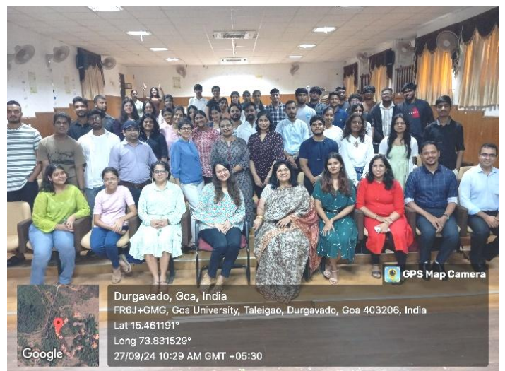
Students and faculty group photo