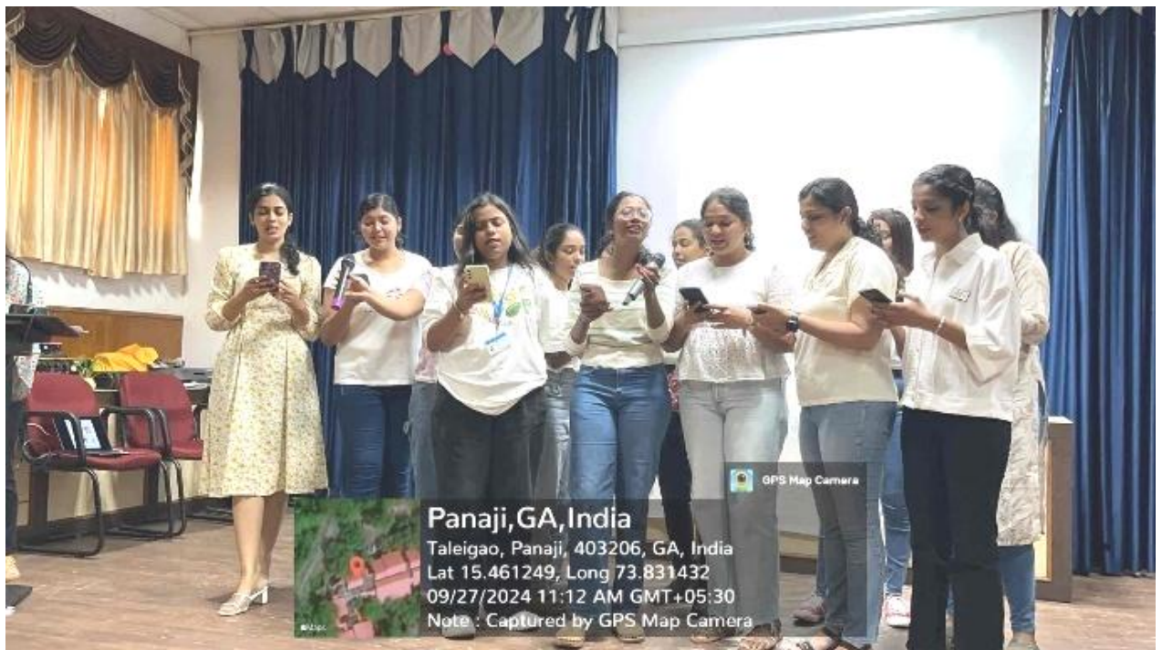
Group singing at the event 'Do-Re-Mic Drop' by the students of the Discipline of English