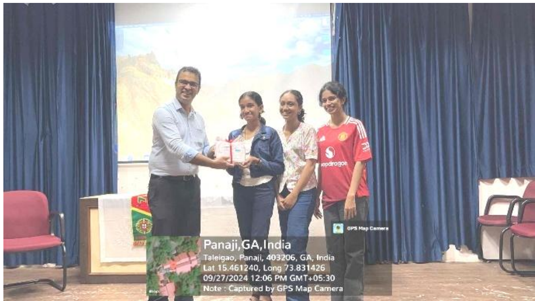
Winners of the event "Reel'y hard to say"