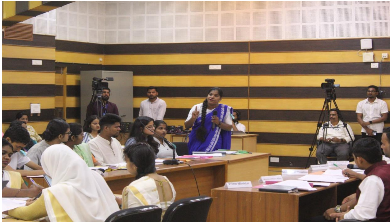
Students raising pertinent issues during the proceedings