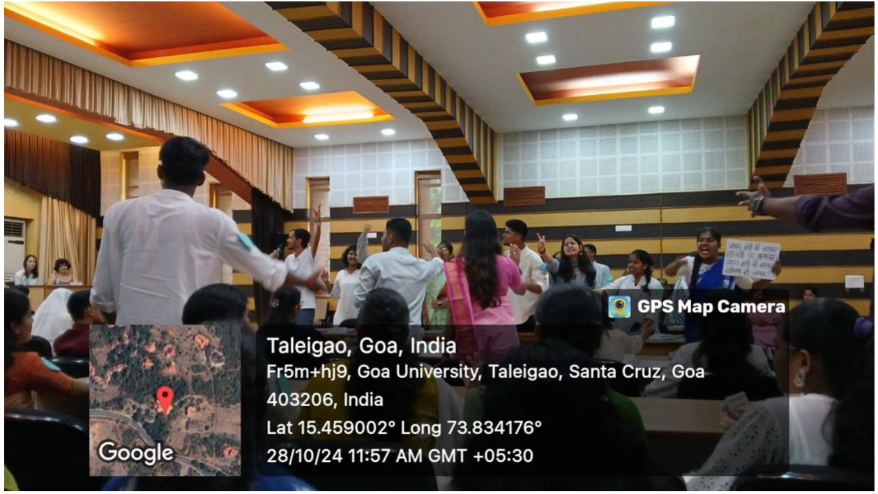
GROUP PICTURE- NYPs 2024 WITH PARTICIPANTS AND DIGNITARIES