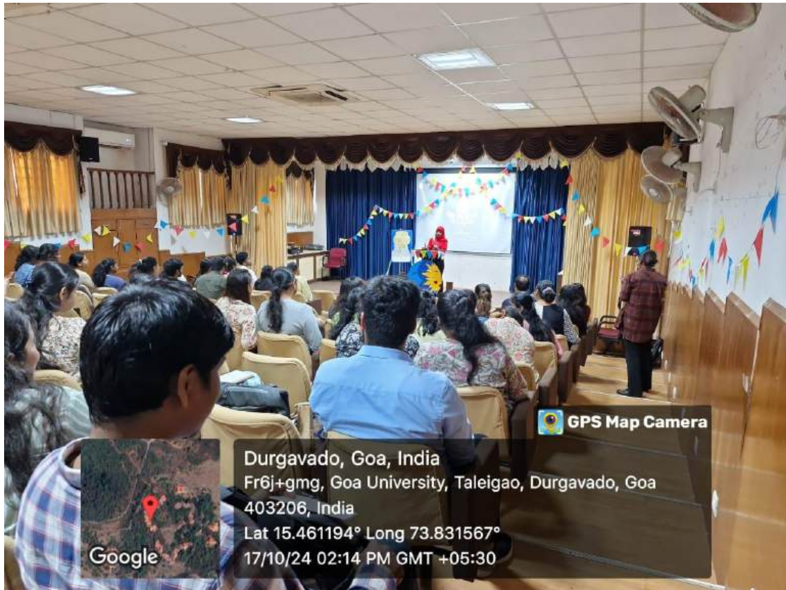
Figure 1: A Goa University MA English student passionately presents her original poem