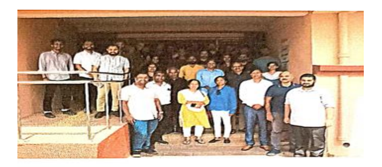
Report 6: School of International & Area Studies

The main objective of this meet is to establish a network with students, faculty members and alumni of DCST and to seek employment opportunities for students in the companies where the alumni are currently established. Also, alumni can help current students of DCST to provide internships and training. Alumni settled in various cities of India can help in hosting our students to their city during the study cum placement tour which is being organised by DCST every year, this also may lead to getting jobs in the reputed company.