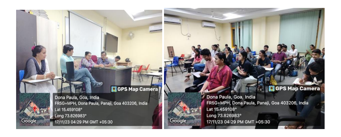
Report 15: School of Biological Sciences and Biotechnology

Alumni Interaction on Lecture on "How to be an entrepreneur in the field of Biotechnology" and "Engineering Heat Resilience in Rice: A Climate Change Counter measure" on 15th December 2023 at 2.30 pm to 4.30 pm