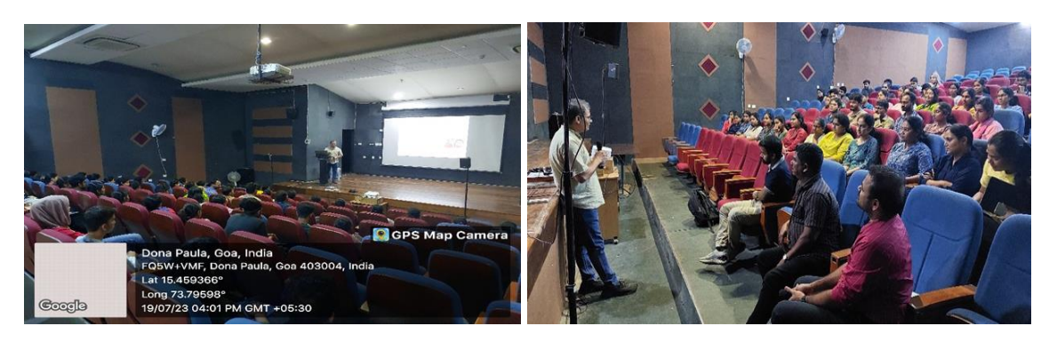
Report 10: School of Chemical Sciences