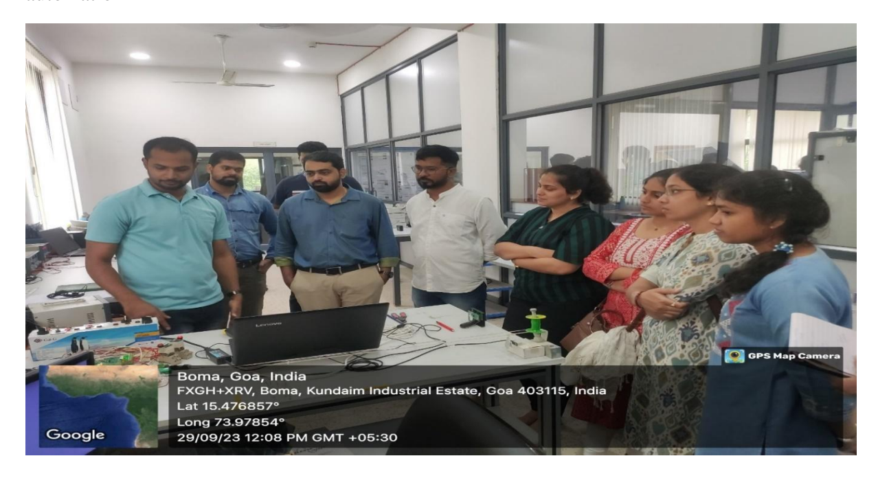
Report 13: Shenoi Goembab School of Languages and Literature

The MSc students got a chance to interact with Alumni of the Electronic programme, SPAS at EME automation. The students had the opportunity to gain insights into the domain expertise and work experience in the field of electronics design and manufacturing. The feedback of the students was very encouraging and had a fruitful dialogue with the alumni placed at EME automation