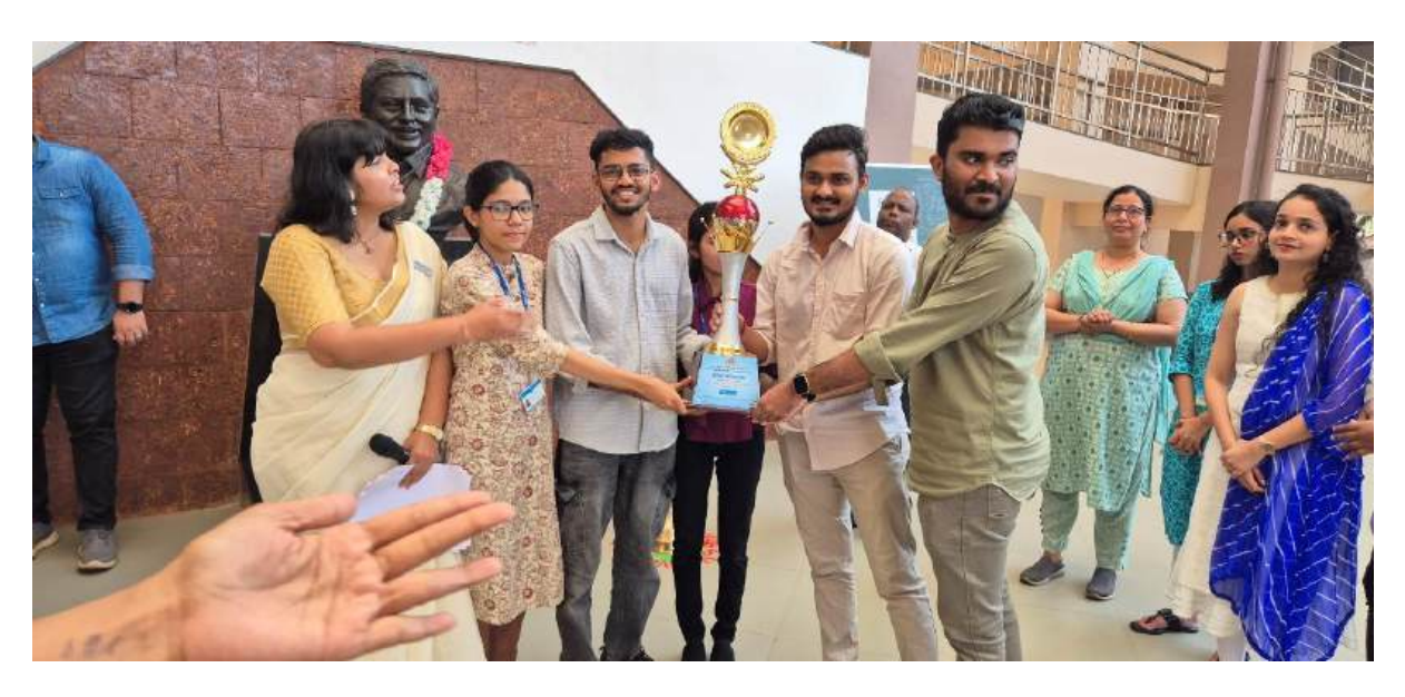
The best school trophy being handed over to School of Chemical sciences