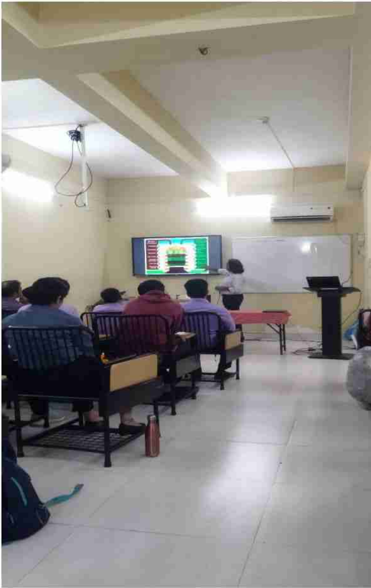
Mr Allwyn explaining what type of matter can be added to compost