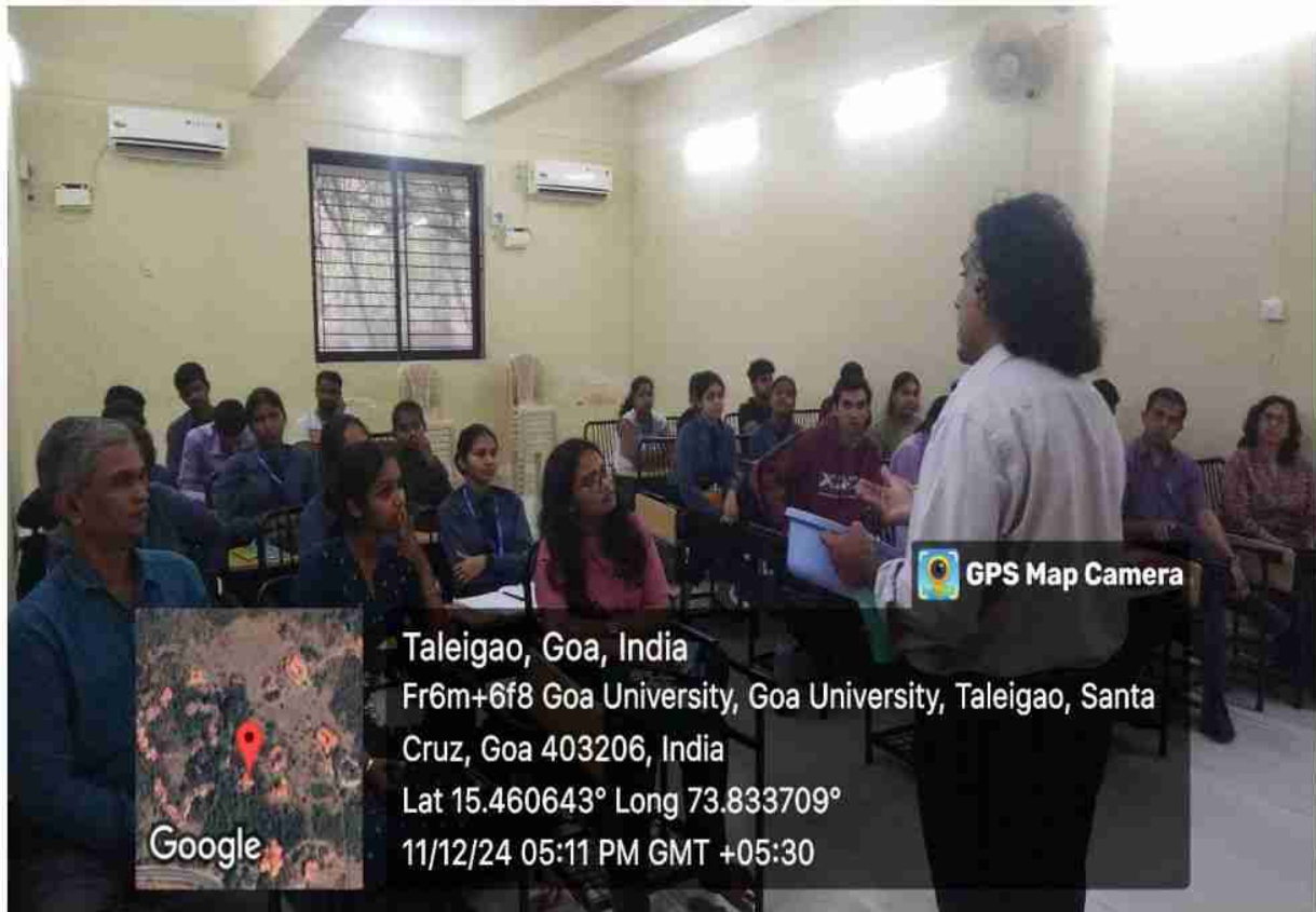
Question and answer session on composting