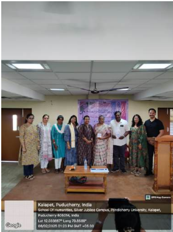
Faculty and resource persons