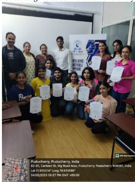
Visit to Institut Francophone International De Recherche Et De Formation En Intelligence Artificielle (I.F.R.I.N.A.)