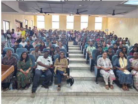
Group picture of the students and teachers at Pondicherry University