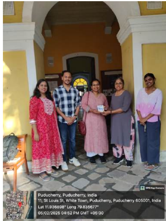
Visit to French Institute of Pondicherry