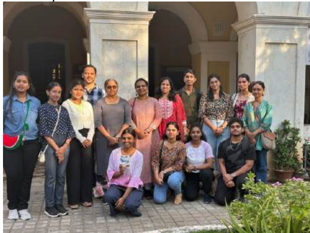
Students of Goa University at Institut Français de Pondichéry