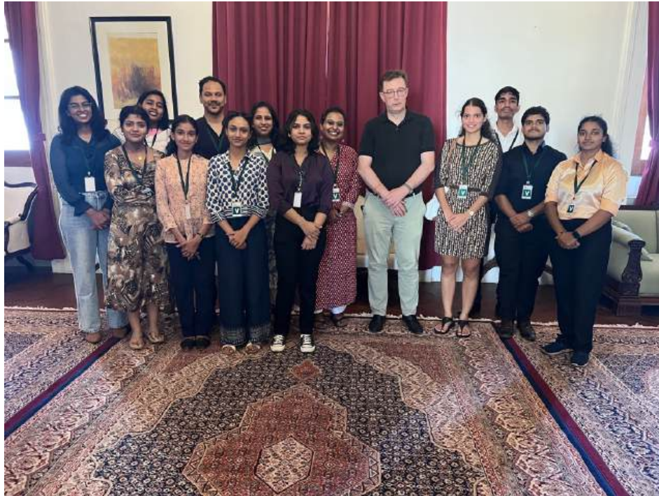
Visit to the Consulat général de France à Pondichéry et Chennai