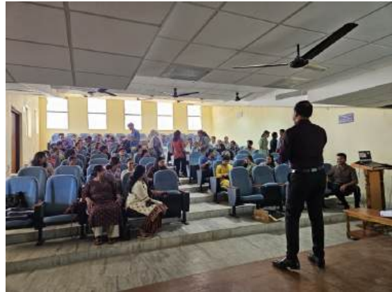
Resource person delivering a classroom session to the B.A. and M.A. French students.