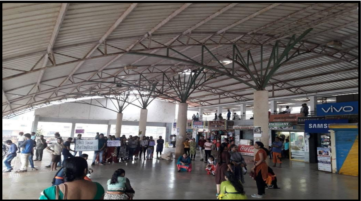
AWARENESS PROGRAMME AT CANCONA KTC BUS STAND