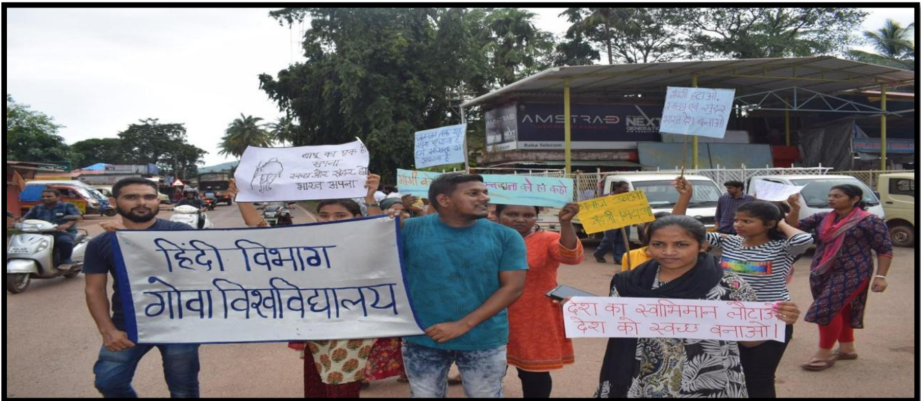
CLEANLINESS AWARENESS PROGRAMME AT CANCONA MARKET