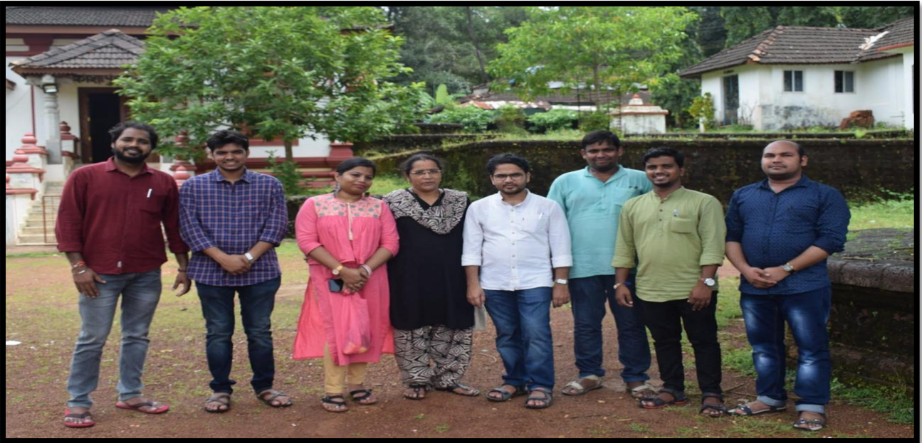
FACULTY AND RESEARCH SCHOOLERS ATTENDED FIELD TRIP