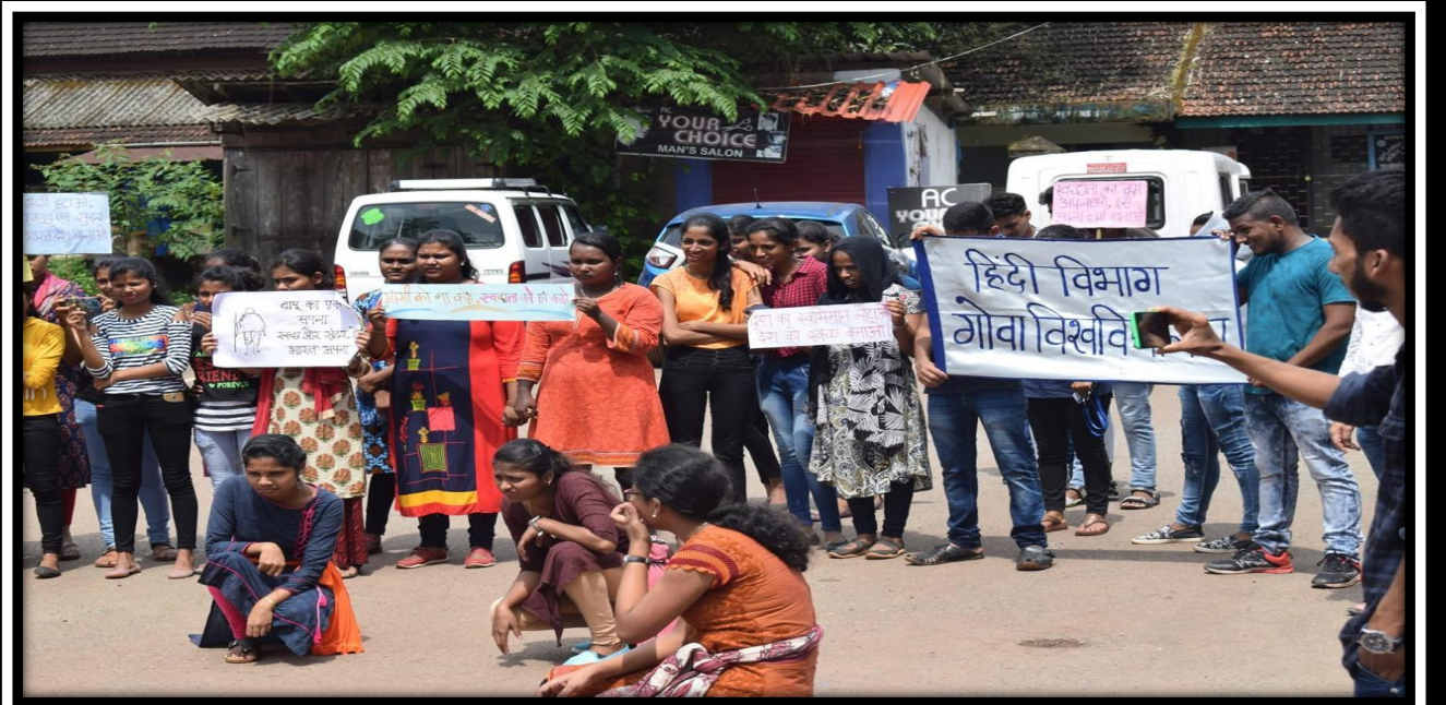
STUDENTS PERFORMING STREET PLAY AT CANCONA MARKET