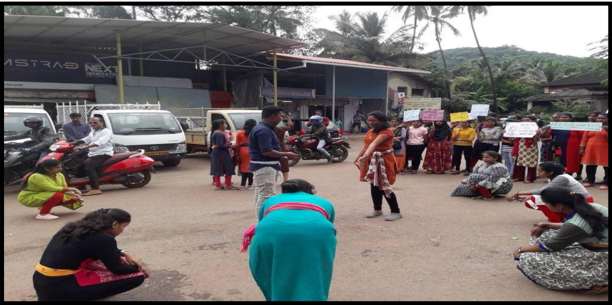
STUDENTS PERFORMING STREET PLAY AT CANCONA MARKET