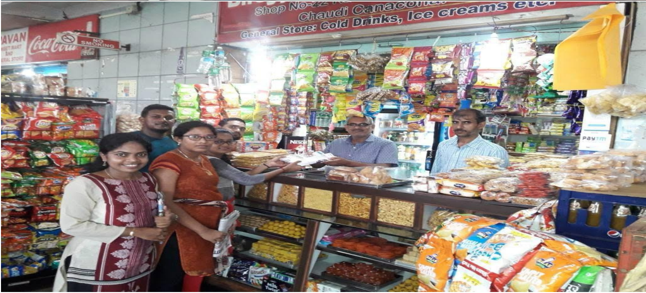
DISTRIBUTION OF PAPER BAGS TO THE SHOPKEEPER AT KTC BUS STAND CANCONA