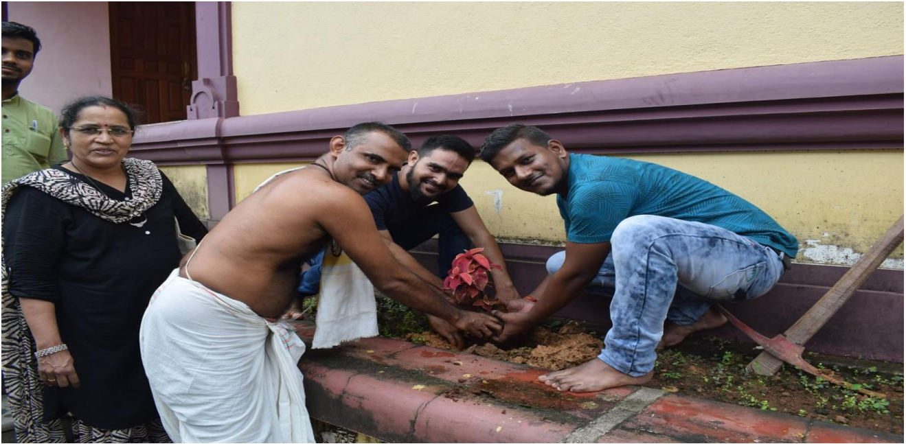
TREE PLANTATION DRIVE AT MALLIKARJUN TEMPLE AT CANCONA