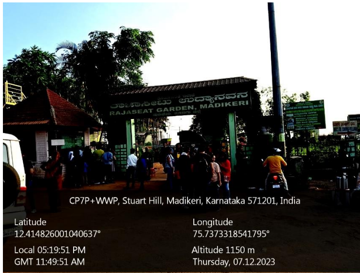
CP7P+VWP, Stuart Hill, Madikeri, Karnataka 571201, India

Latitude 12.414826001040637° Local 05:19:51 PM GMT 11:49:51 AM