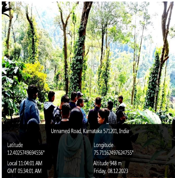
Unnamed Road, Karnataka 571201, India

Longitude 75.7373318541795° Altitude 1150 m Thursday, 07.12.2023