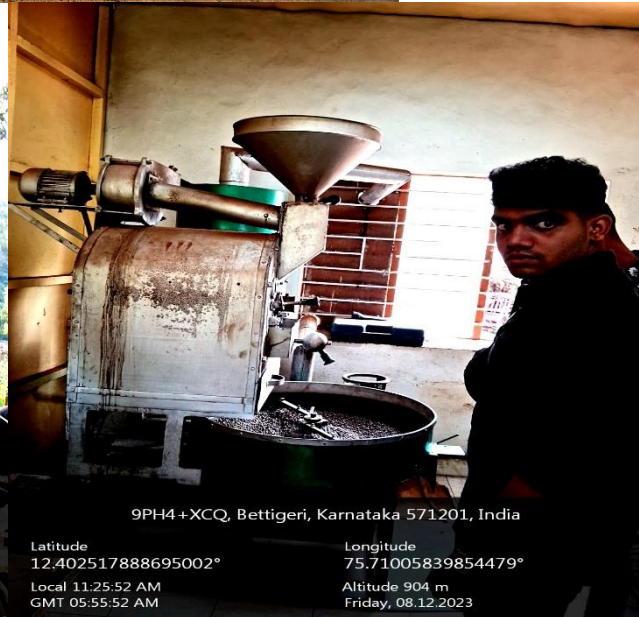
9PH4+XCQ, Bettigeri, Karnataka 571201, India

Longitude 75.71162497624755° Altitude 948 m Friday, 08.12.2023