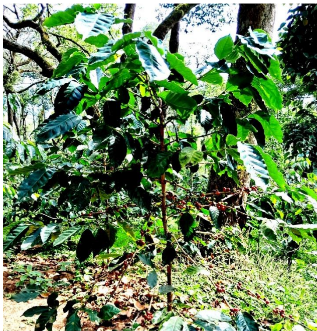
Unnamed Road, Karnataka 571201, India

Longitude 75.71004314348102° Altitude 922 m Friday, 08.12.2023