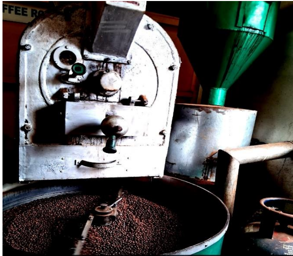
Unnamed Road, Katakari, Karnataka 571201, India

Latitude 12.402307041920722° Local 11:26:05 AM GMT 05:56:05 AM