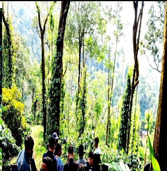
Unnamed Road, Karnataka 571201, India

Longitude 75.71151307784021° Local 11:04:05 AM GMT 05:34:05 AM