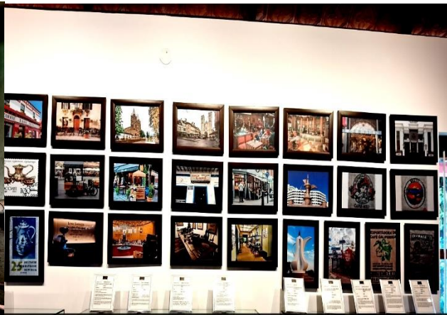
Unnamed Road, Katakari, Karnataka 571201, India

Longitude 75.71000802330673° Altitude 922 m Friday, 08.12.2023