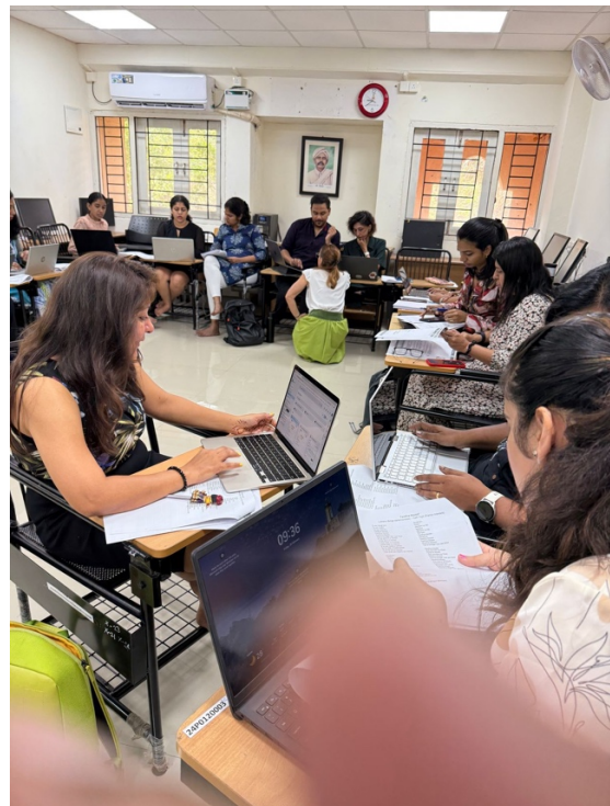
Hands-on training on using Francophone songs in teaching French.