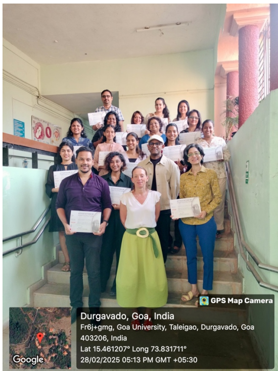
Participants with certificate of participation.